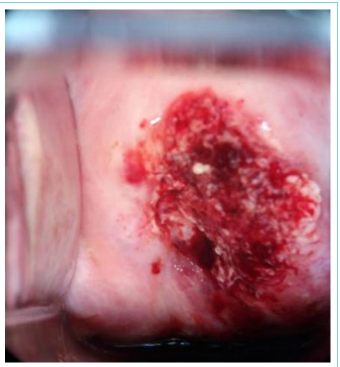
Figure 4. Digital cervicograph showing cervical cancer.