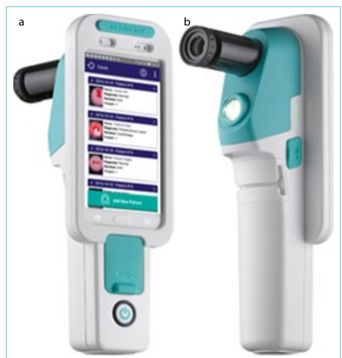
Figure 1. EVA™ system. (a) Front view of EVA™ system and CervDx application. (b) Back view of EVA™ system.

The purpose of this study was to screen and treat women in remote communities on the periphery of Iquitos, Peru in the Amazon basin for cervical dysplasia and cancer. Screening was performed in October 2017 using a digital handheld colposcope (EVA™ system, MobileODT, Israel). Amazon Promise, a local NGO that partners with governmental health clinics, identified communities that had not been previously screened. Patients were screened on a first come, first served basis. Screening was carried out by one of five providers including an ASCCP-certified colposcopist, and consisted of a speculum examination followed