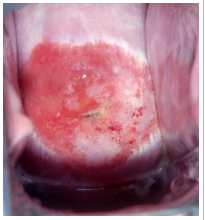
Figure 3. Digital cervicograph showing CIN3.

the patient's lesion. All cryotherapy was performed according to WHO guidelines with a 3-minute freeze, a 5-minute thaw, and then another 3-minute freeze of the cervix. [8] Women with probable high-grade lesions had a LEEP performed according to WHO guidelines. [9] Women with