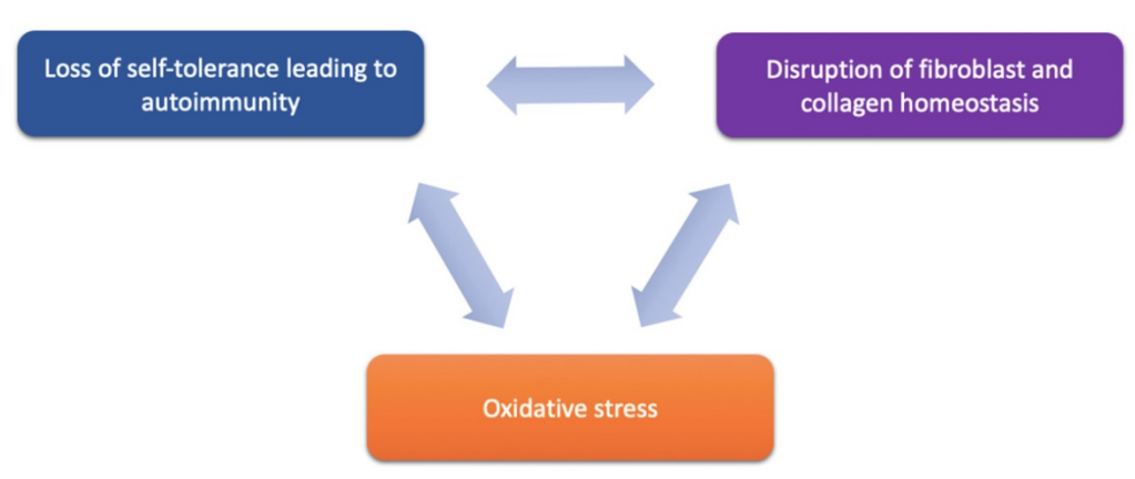
Figure 1. Proposed components of LS pathogenesis. Emerging immune and genetic targets implicated in mediation of LS can be divided based on their functional involvement into three proposed components of LS pathogenesis: (1) loss of self-tolerance to induce autoimmune mechanisms, (2) disruption of fibroblast and collagen homeostasis, and (3) induce oxidative stress.

ECM1 is an 85 kDa soluble glycoprotein [59] with promiscuous extracellular binding targets that includes basement proteins (laminin 332, laminin 10, collage IV, fibulin polysaccharides (HA, heparin, CSA), proteoglycans such as perlecan; phospholipids (phospholipid scramblase 1), and proteolytic enzymes (MM9) [60, 61]. ECM1, therefore, appears to act as the "biological glue" that is responsible for the structural organization and integrity in human skin [32] ( Figure 2). Thus, any disruption to this ECM1 scaffold would result in pathology.