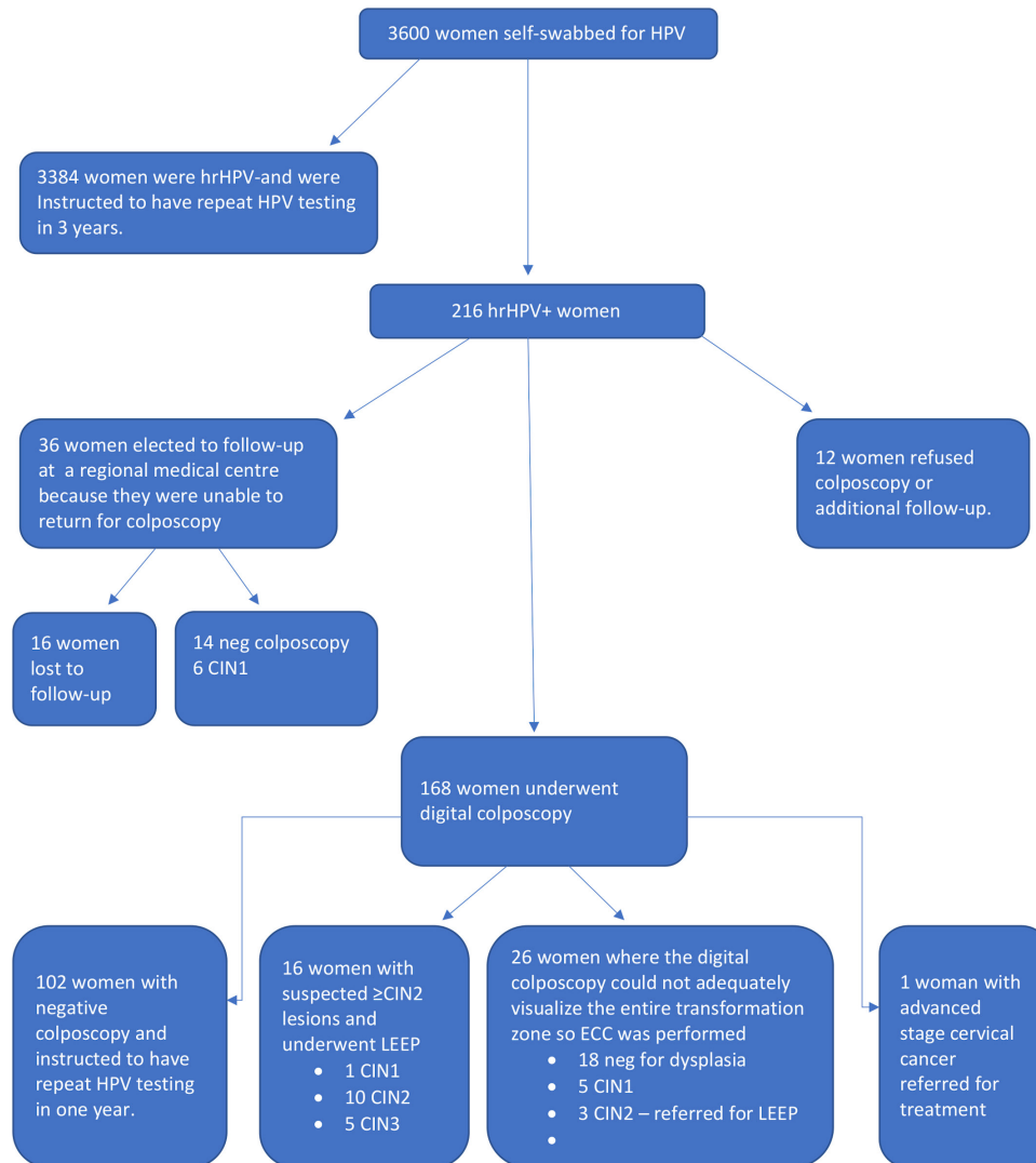
Figure 3 Study results flow chart. CIN, cervical intraepithelial neoplasia; ECC, endocervical curettage; HPV, human papillomavirus; hrHPV, high-risk HPV; LEEP, loop electrosurgical excision procedure.

by colposcopy without biopsy, as well as fewer cervical cancers, and fewer deaths than with an HPV test followed by VIA. As such, this study, and previously performed studies, suggest that WHO guidelines could be modified in countries with the necessary resources to favour digital colposcopy over VIA after HPV testing. 19